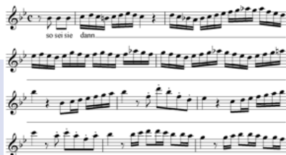
The famous coloratura passage in the first aria for the Queen of the Night in Mozart's opera The Magic Flute .