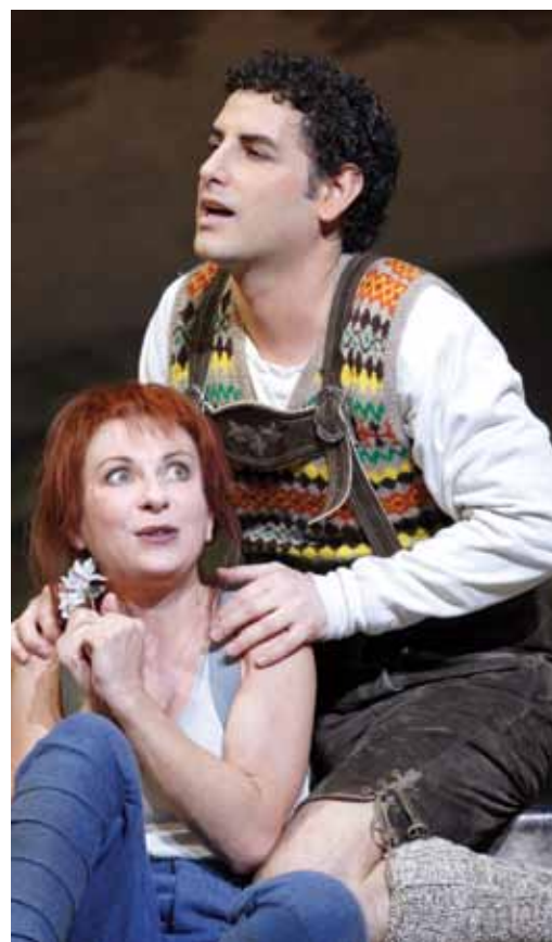
Natalie Dessay and Juan Flórez in La Fille du régiment.