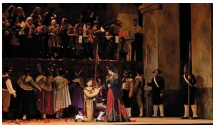
Carmen, Manitoba Opera, April 2010.