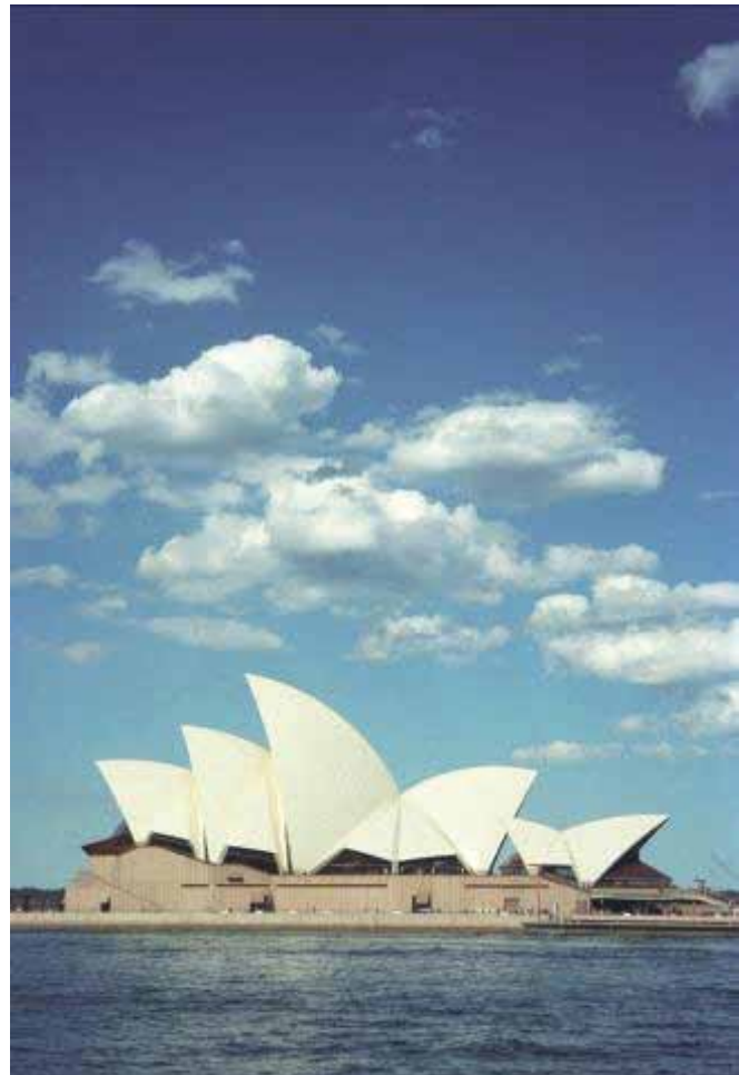
The Sydney Opera House

The story of the opera is written as a libretto: a text that is set to music. Composers write the score or the music for the opera. Sometimes