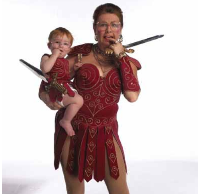
Mary Walsh in character as Marg Delahunty, Warrior Princess.

Earlier this year, Toronto's mayor, Rob Ford called the police on Mary when she approached him for an interview dressed as Marg.