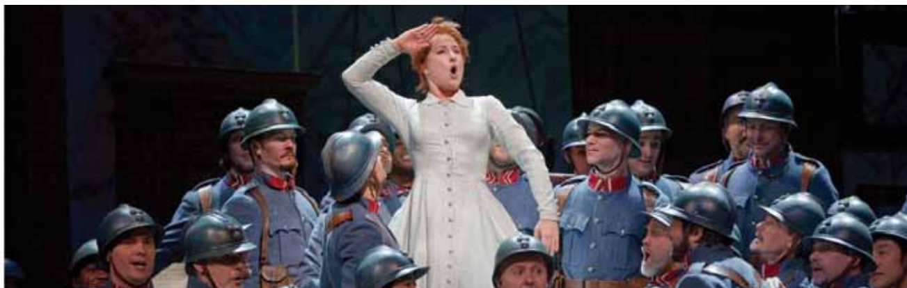
Diana Damrau as Marie in the Metropolitan Opera production of La Fille du régiment.