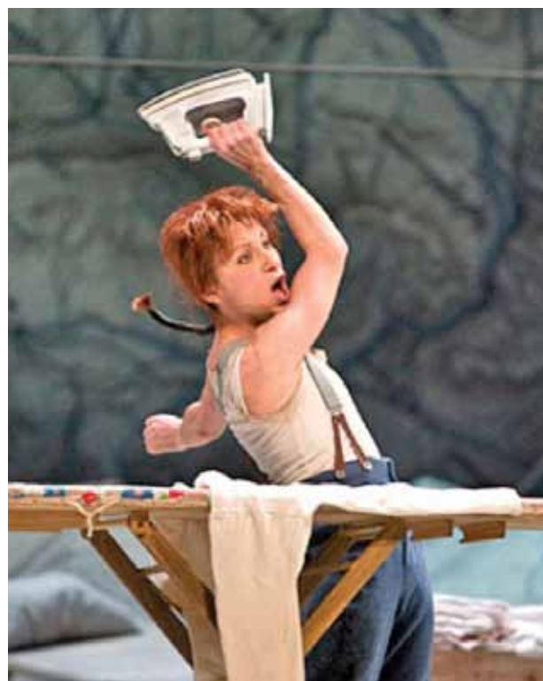
Nathalie Dessay in La Fille du régiment at the Met (2008).