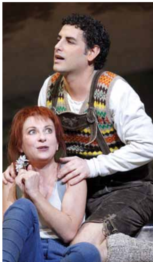
Natalie Dessay and Juan Flórez in La Fille du régiment.