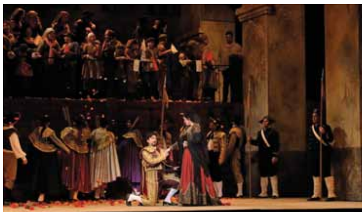
Carmen, Manitoba Opera, April 2010.