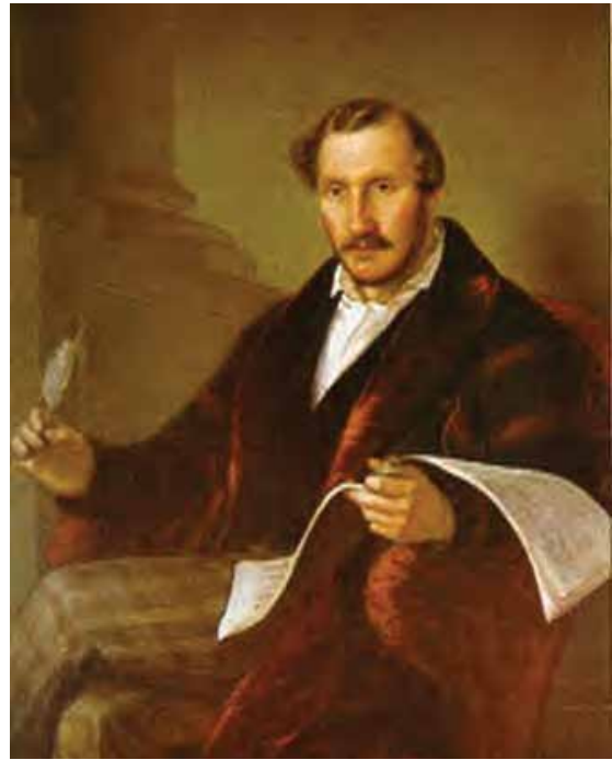
A portrait of Gaetano Donizetti

Gaetano Donizetti, son of a pawnshop caretaker and a seamstress, was born and died at Bergamo, Italy, like many of his opera characters, a victim of madness. To the older, baroque-based style known as bel canto (characterized by long, ornamented vocal lines), he added a dramatic urgency, especially in dialogue, that paved the way for Verdi and verismo. Like his colleagues Rossini and Bellini, Donizetti was primarily a melodist. Yet, out of his admiration for the classical masters Haydn and Mozart, he developed a sharp ear for orchestration - unobtrusive but sensitive - and for the dramatic shaping of concerted pieces along symphonic lines.