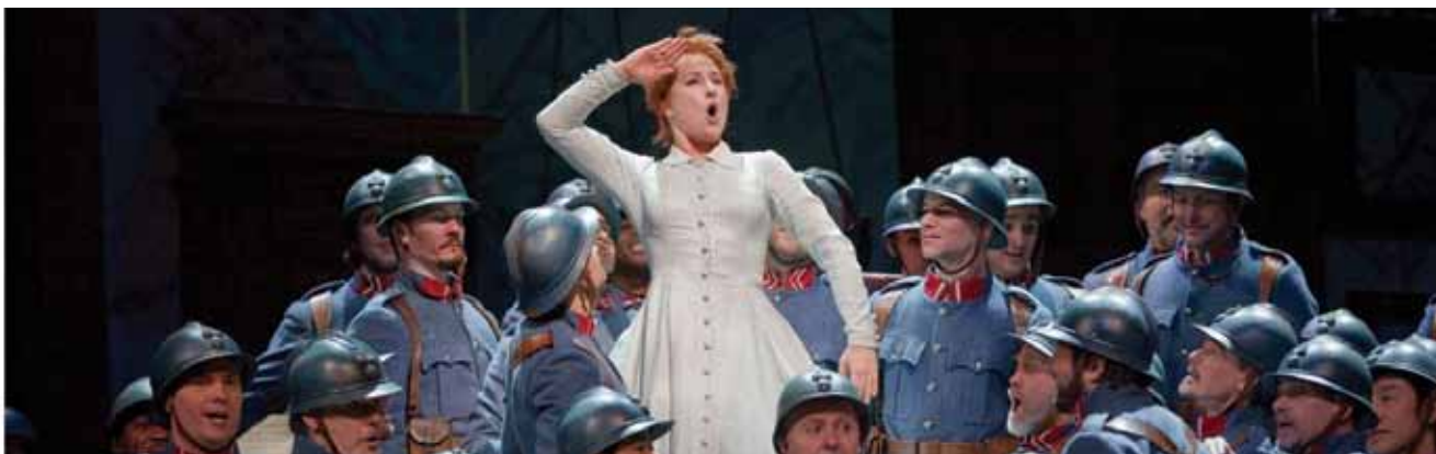
Diana Damrau as Marie in the Metropolitan Opera production of La Fille du régiment.