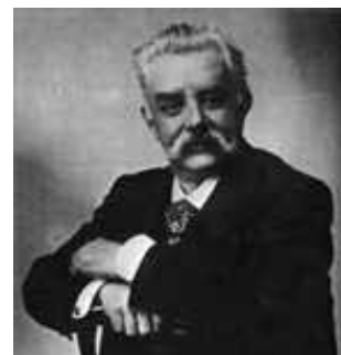
Jules-Henri Vernoy Do Saint-Georges

As he did on La Fille du régiment , Saint-Georges often collaborated with other writers. In total, he wrote over 70 different works, most of them operas comiques with a rather predictable approach; his plotlines depended on improbable coincidences and lacked convincing characterization. In 1829 he became manager of the Opéra-Comique in Paris.