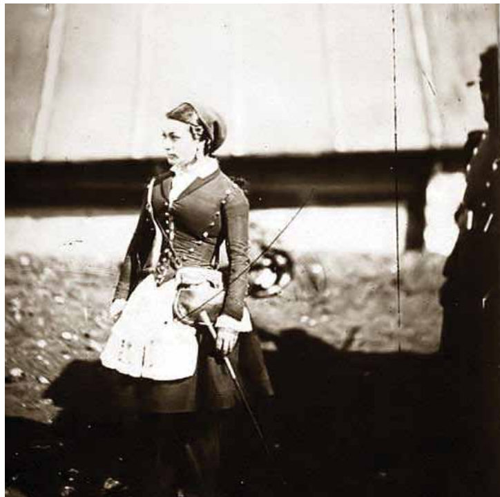
A French cantinière in the Crimea during the Crimean War in 1855.