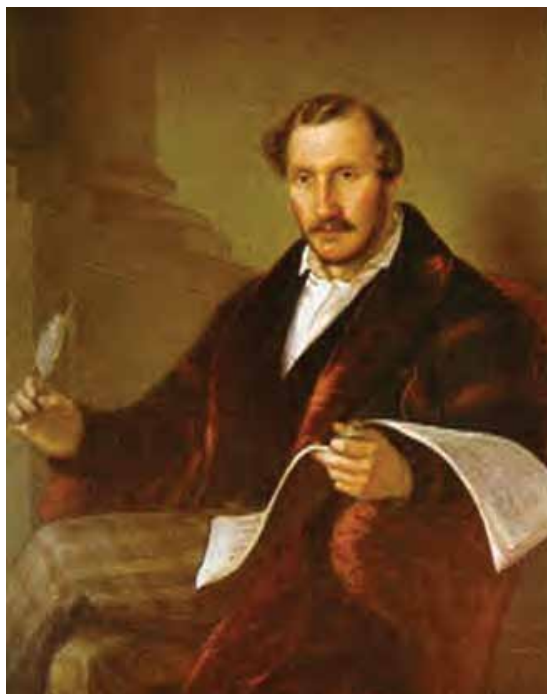
A portrait of Gaetano Donizetti

Gaetano Donizetti, son of a pawnshop caretaker and a seamstress, was born and died at Bergamo, Italy, like many of his opera characters, a victim of madness. To the older, baroque-based style known as bel canto (characterized by long, ornamented vocal lines), he added a dramatic urgency, especially in dialogue, that paved the way for Verdi and verismo. Like his colleagues Rossini and Bellini, Donizetti was primarily a melodist. Yet, out of his admiration for the classical masters Haydn and Mozart, he developed a sharp ear for orchestration - unobtrusive but sensitive - and for the dramatic shaping of concerted pieces along symphonic lines.