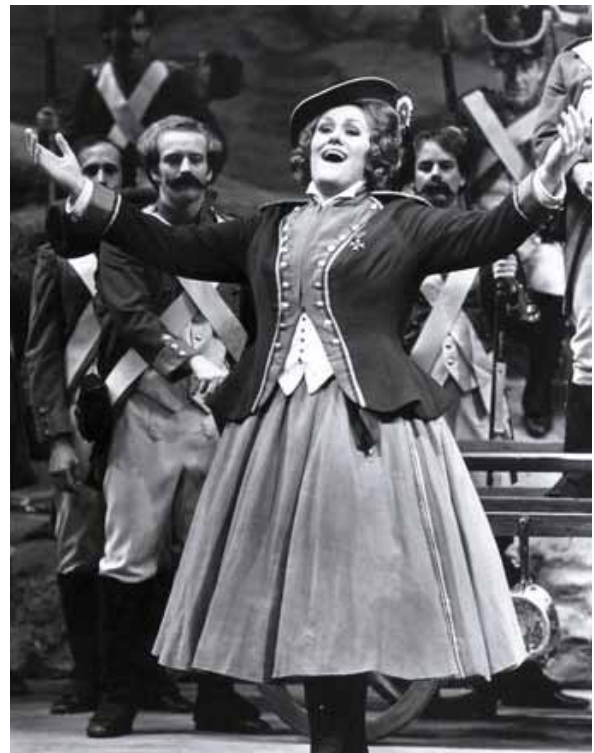
Joan Sutherland as Marie in The Daughter of the Regiment .