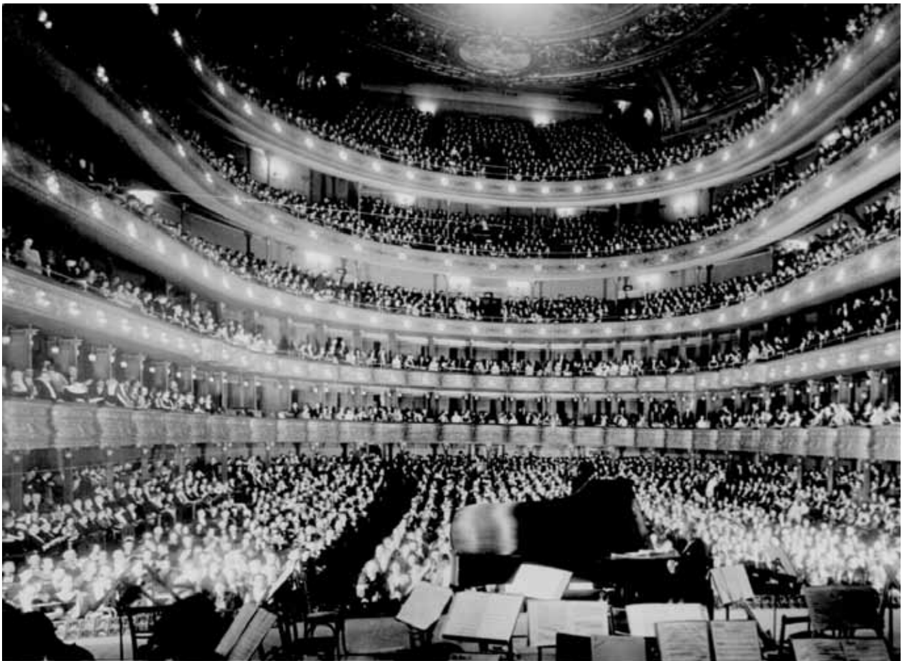
The Metropolitan Opera (1937)

The musical style is another important difference between the two art forms; opera is usually classical and complex, while musicals feature pop songs and sometimes rock and roll. Also, singers in musicals have microphones hidden in their costumes or wigs to amplify their voices. The voices of opera singers are so strong no amplification is needed, even in a large venue. Furthermore, operas are almost completely sung while the use of spoken words are more common to musicals. There are some operas with spoken words and these are called singspiels (German) and opéra-comique (French). Examples are Mozart's The Magic Flute and Bizet's Carmen , respectively.